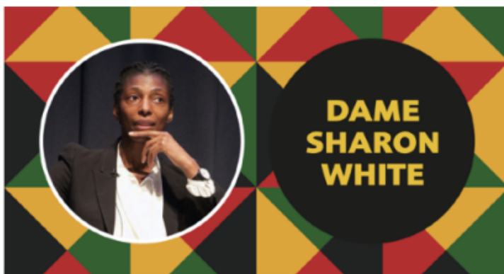
DAME SHARON WHITE

Trevor Beresford Romeo OBE better known as Jaz B (born 1963) is a British DJ and music producer. He is the founder of Soul II Soul.